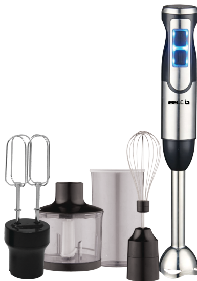
HAND BLENDER 1000W Model: IBL HB1000J

(This instruction manual covers various colour versions of the product)